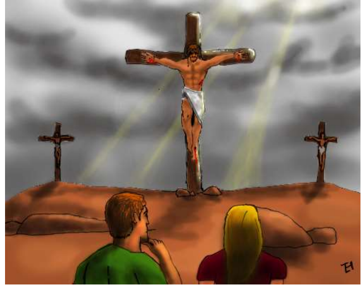
Why did Jesus die?