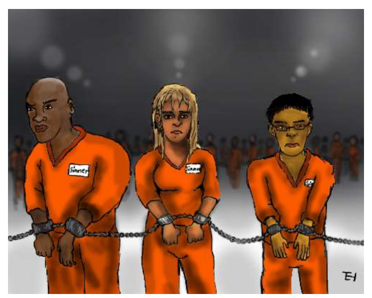
We are all sinners!

Romans 3:23 Tucuy juchallicuncu, salvacoj Diosmantataj carunchacapuncu.